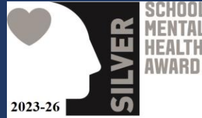
School Mental Health