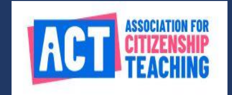
Climate Empowerment & sustainability Award