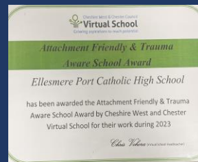
Trauma Aware School Award