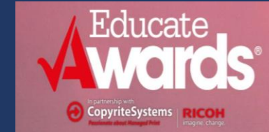
Wow Recognition Award